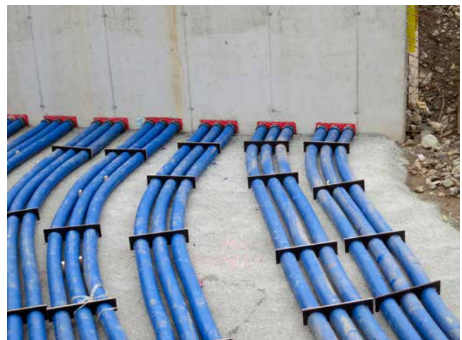
KMA and spiral hose Hateflex14150