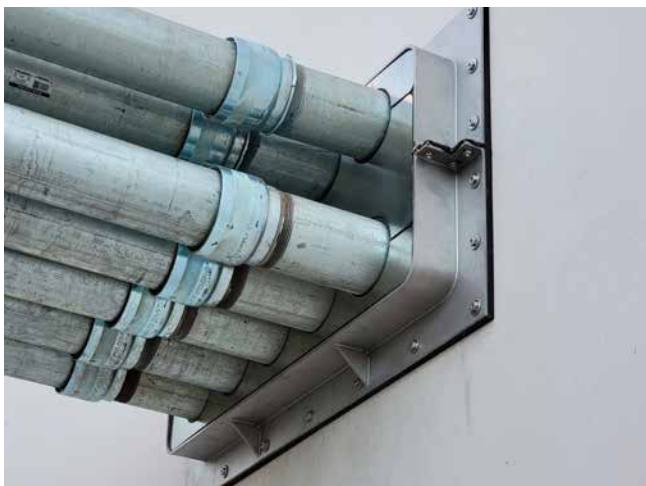
Stainless steel flange split for subsequent dowelling

* Articel number, GTIN and price are available after publication