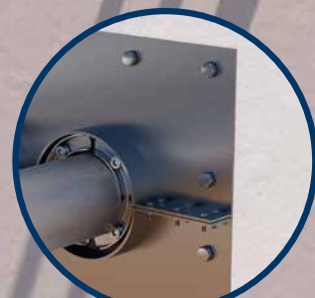
FAG with HSD